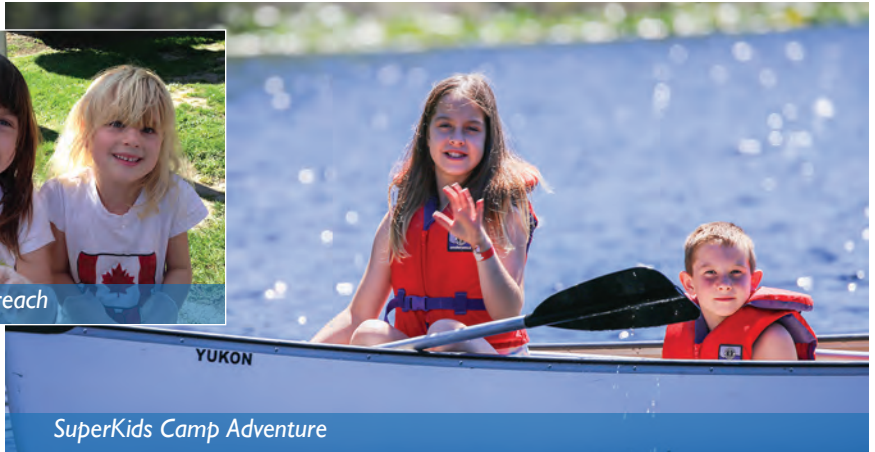
SuperKids Camp Adventure