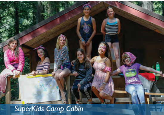
SuperKids Camp Cabin

"Congratulations on your effort to make a difference. These events help residents bring pride into the community and creates a sense of belonging."