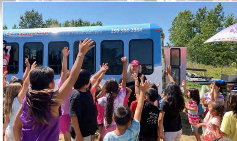
Tsawout First Nation BBQ