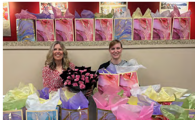
Mother's Day Outreach