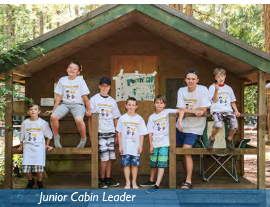
Junior Cabin Leader