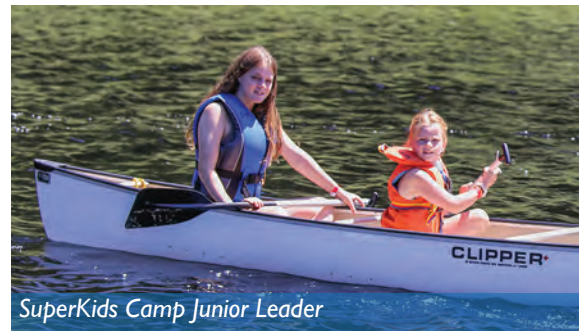
SuperKids Camp Junior Leader