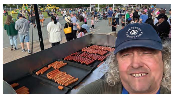
Marigold Elementary's Spring Fair

"The Mother's Day gift bag was such a lovely surprise and such a well-thought-out bunch of gifts. It's so heartwarming that Extreme Outreach thought about us. It certainly stopped me in my tracks on such a bittersweet day for myself. My circle is small while I navigate through life right now so I was absolutely touched by the gifts." ♥ Grateful Recipient