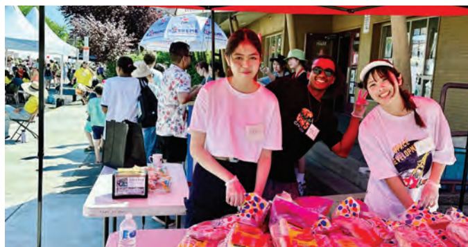
Quadra Village Day