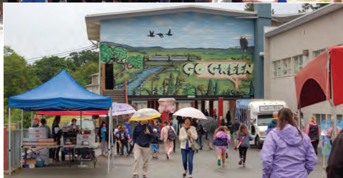
View Royal Elementary's Fun Fair

W e had a great time doing a BBQ for Tsawout's summer kids camp! Many of the kids have been part of our SuperKids programs for years. We gifted each child with a brand-new backpack as a special treat, and they were overjoyed! Many of them were asking to take one for their siblings and cousins, so we left extras for the leaders to help distribute to kids who were not there. It's wonderful to see how a simple gift can bring such happiness. ❤️