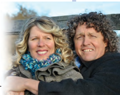
26 years serving together, 17 years of marriage ❤️

It has been a crazy ride but a good one. God uses my past now to encourage others to know Him. I started Extreme Outreach Society, and now we're celebrating 26 years.