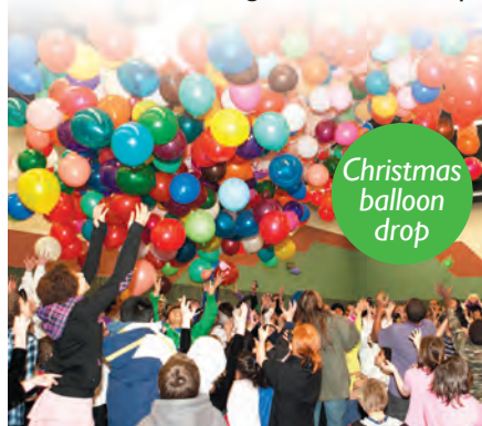
Christmas balloon drop

We have also provided a free Christmas dinner since the beginning. Over the years, this traditional Christmas dinner has become a place where we give each child and youth a stocking and gift, have a bike draw for the kids and youth, and have door prizes for the parents. The dinner is now held at Songhees Wellness Centre for over 400 guests with the help of over 100 volunteers.