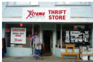
Extreme Thrift Store

Around 2005, Extreme Outreach purchased 8 houses on McKenzie Avenue to provide a safe, drug-free place for those transitioning out of rehab centres and the like. We also ran an Extreme thrift store for 2 years, had 50 gumball machines in businesses, and owned