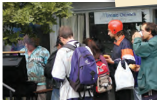
BBQ at Holiday Court