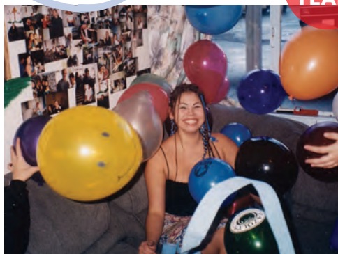
Residents at the motel could not always celebrate birthdays due to living in a non-stop crisis. We made it a point to celebrate with them. Tears flowed many times.

The first 5 years focused on helping the people who lived at Holiday Court Motel, Victoria's main epicentre of crime. It was previously a tired tourist hotel but had become the unofficial transition house for the drug-addicted, prostituted, and just plain out of luck. I quit my drywall career and moved into room 21. My goal was to love the residents there, yet much more began to happen. Slowly I gained the trust of the people in the motel, and their lives began to change. I brought them to treatment centres, taught drywall, helped with job placements, and started a teen basketball team. The constant police presence, overdoses, and fights were starting to fade until they were no longer present. The motel was eventually sold and torn down. To my surprise, where my room 21 had been, there's now a continuously flowing 3-pillar fountain.