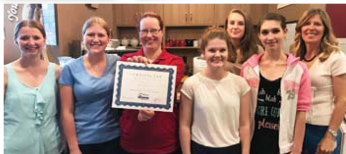
Youth training program successes!