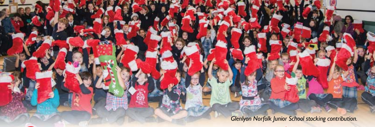
Glenlyon Norfolk Junior School stocking contribution.