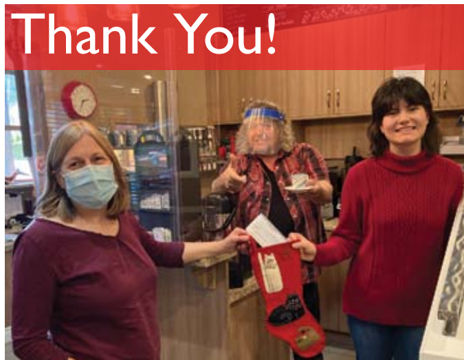
Thanks to our other large Christmas donors – Truth Centre (pictured) and United Way.