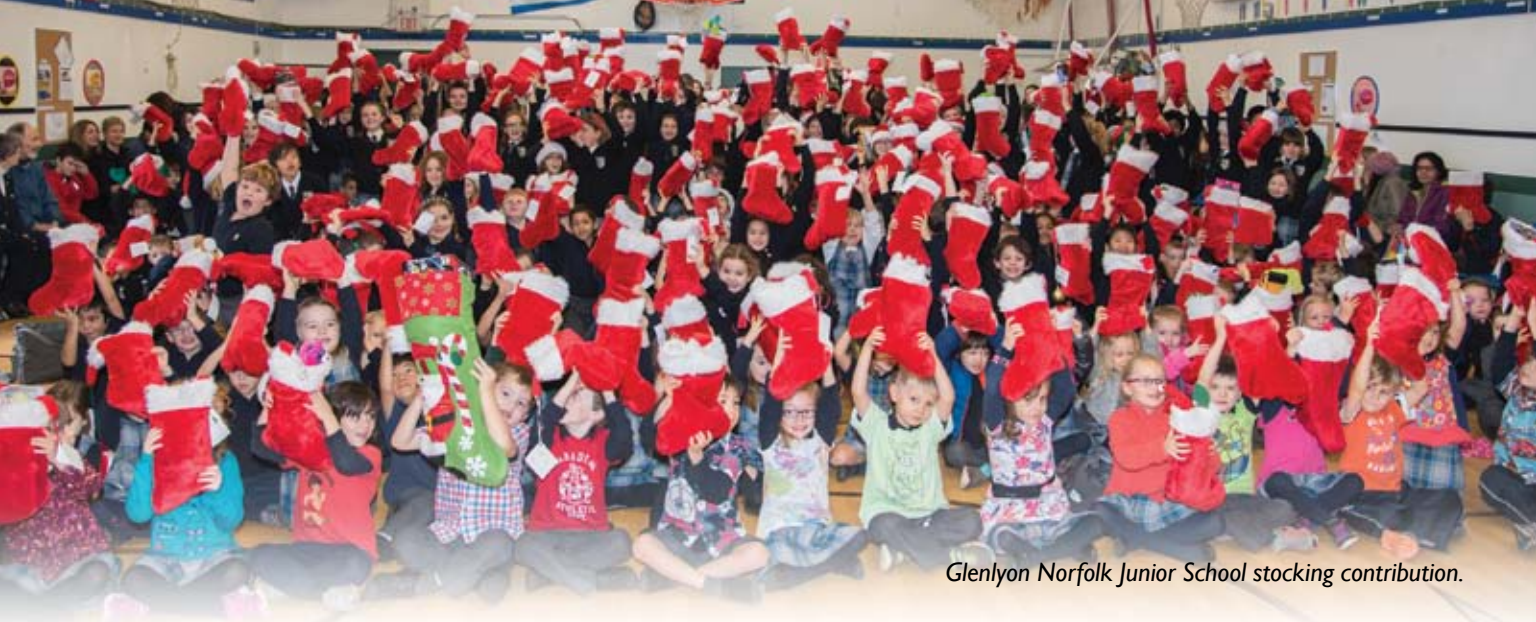
Glenlyon Norfolk Junior School stocking contribution.