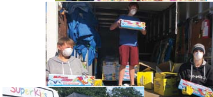
During Covid Extreme has been partnering with Salvation Army delivering hampers to people still in isolation.

“My daughter was so excited when she went to the door after the truck left. She even stood in the door way and was just listening to how excited kids were to find a special treat. It brightened her day so much and I loved showing her how we can all help each other right now, even when everyone is feeling so isolated.” ♥