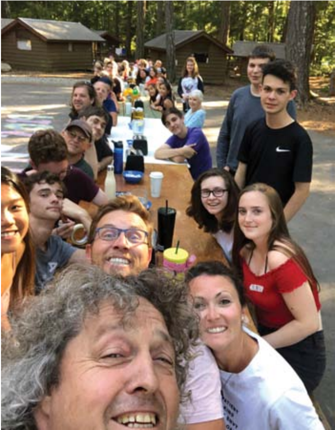
Volunteers enjoying a big dinner feast before the kids arrive the next day! (Camp 2019)

E xtrême Outreach Society has been providing free programs to support local underprivileged children and youth for 22 years. Our goal is to continue serving these children, and community support is critical in order to do so. Due to the ongoing COVID-19 pandemic, the BC government has announced that no overnight camps will be allowed to run this summer. In place of our 17th Annual SuperKids Summer Camp, we will be hosting SuperKids Summer Day Camps at different locations in Greater Victoria. We will be following all the provided health guidelines to ensure safe and fun filled days. Starting in July, each week we will be providing children and youth with meals, games, and fun filled activities, giving them hope and encouragement during this unprecedented time. All costs for these outreaches will be covered through our fundraising efforts. Our goal is to raise $25,000. We are grateful for your support over the years. We value your partnership, and look forward to your support again this year. Thank you! ❤️