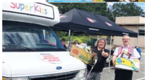
During Covid Extreme has been partnering with Salvation Army delivering hampers to people still in isolation.

“My daughter was so excited when she went to the door after the truck left. She even stood in the door way and was just listening to how excited kids were to find a special treat. It brightened her day so much and I loved showing her how we can all help each other right now, even when everyone is feeling so isolated.” ♥