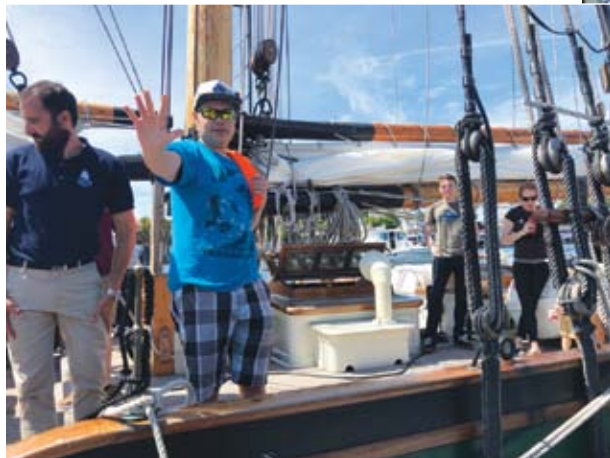
S.A.L.T.S sailing trip – thank you S.A.L.T.S!