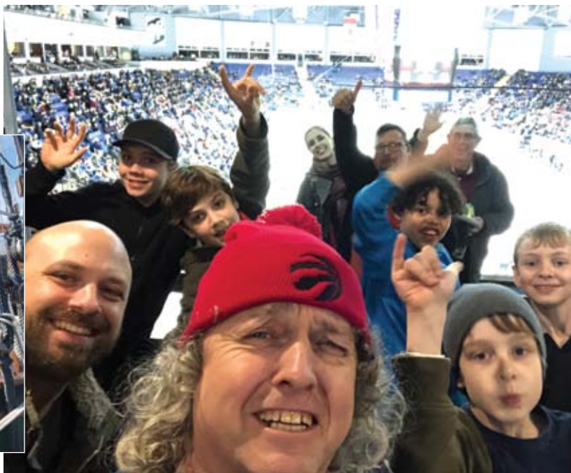
SuperKids boys hockey event.