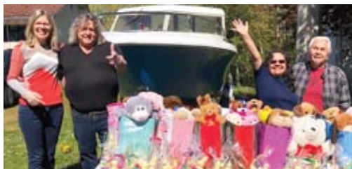
Tsawout First Nations Easter Outreach.

D uring the pandemic, Extreme has been able to deliver food and gift baskets to many families, and pick up people that needed to be isolated. At Easter we delivered 300 gift bags to children. We have been available for families who need help.