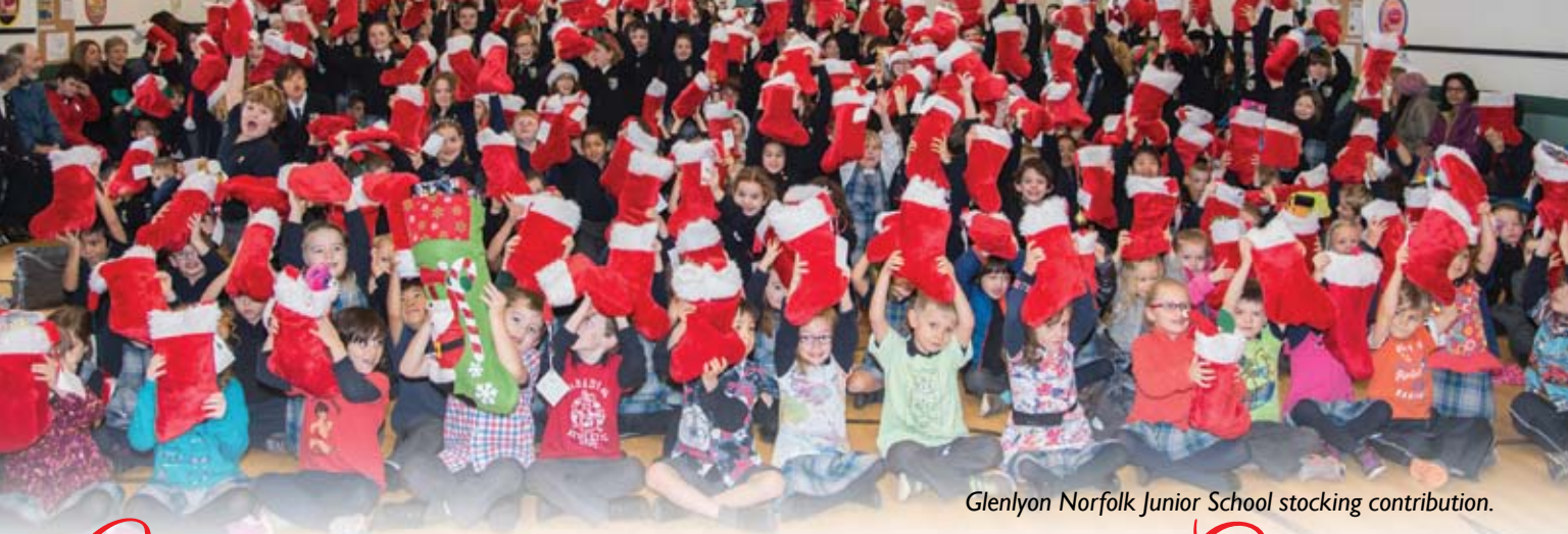
Glenlyon Norfolk Junior School stocking contribution.