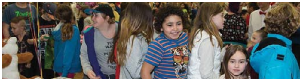
Kids lined up for Christmas gifts.