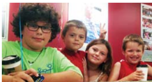
Hot chocolate, Yum!