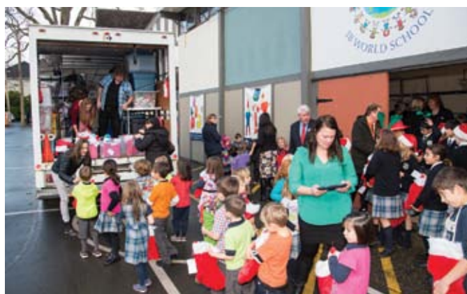
Glenlyon Norfolk Junior School students bring out the stockings.