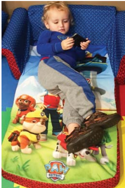
Kids love the Kid's Corner!

102 – 284 Helmcken Road Monday–Friday, 8:30 am–4 pm 250-383-2064