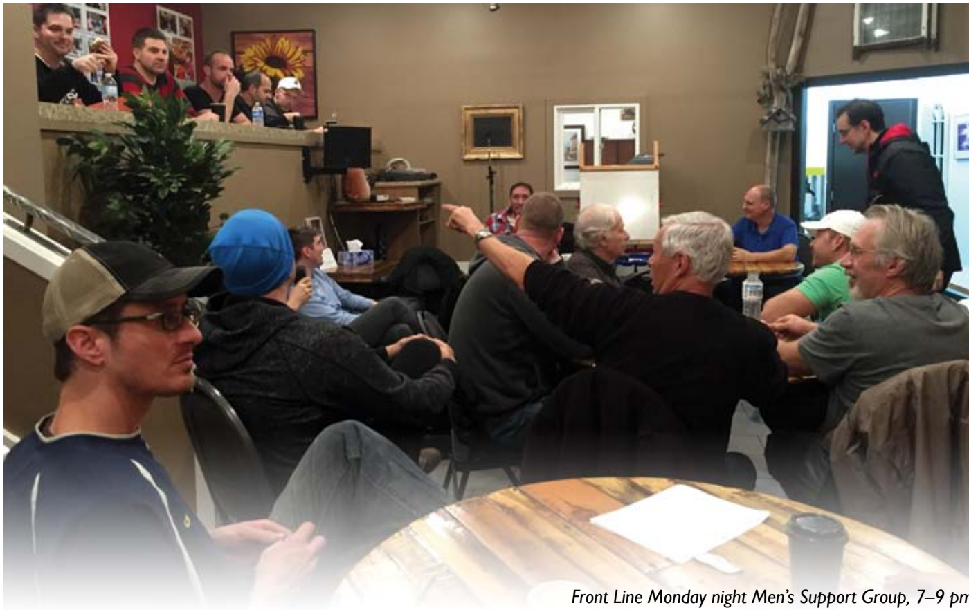
Front Line Monday night Men's Support Group, 7-9 pm.