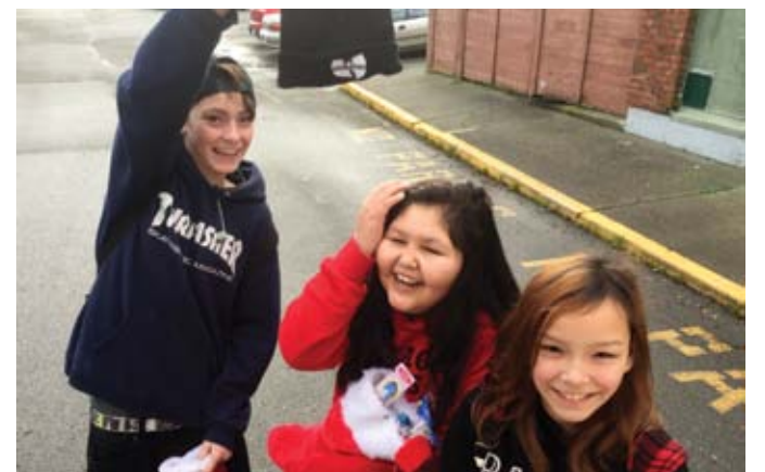
Teen receives exactly what he likes.