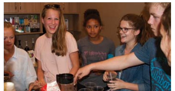
Youth training – making lattes.

This program will commence July 2016 and will run for eight weeks, consecutively for one year as a pilot program. All trainees will work alongside our dedicated coffee house volunteers. Contact us at 250-384-2064 for more details or to register. ♥