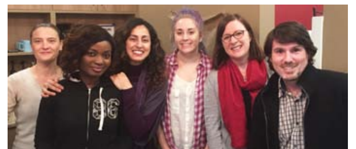
Some of our Coffee House Volunteers.