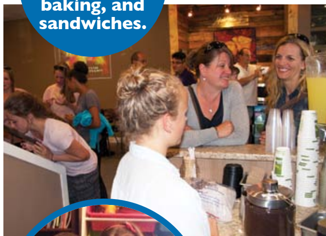
A fun place to hang out.

We are now serving light snacks, gluten-free baking, and sandwiches.