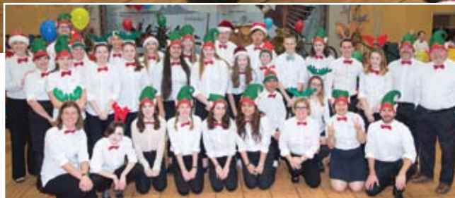
Our amazing volunteers from Glenlyon Norfolk School.