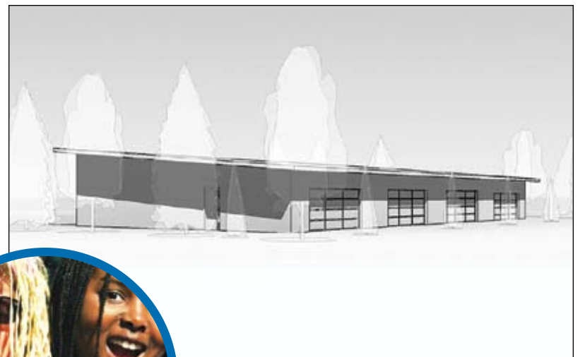
A 5000 sq ft building is needed.

Superkids Camp is going ahead, and will be amazing! ❤️