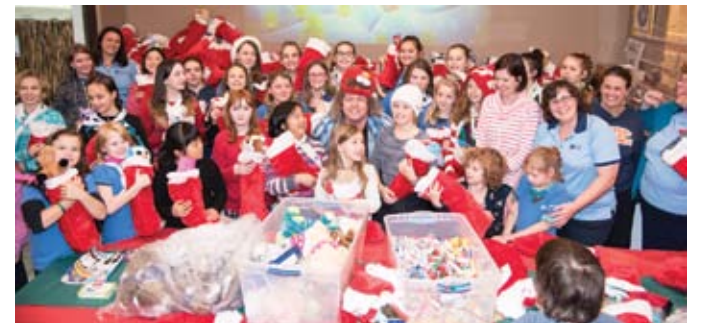
Girl Guide helpers.