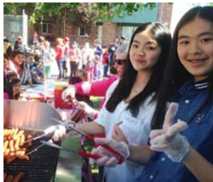
SMUS students in action.

We have hosted many groups at our weekly BBQ and SMUS is always leading the way. We have trained over 200 students in the past five years and it's always fun to see the international students play with the kids. ❤️