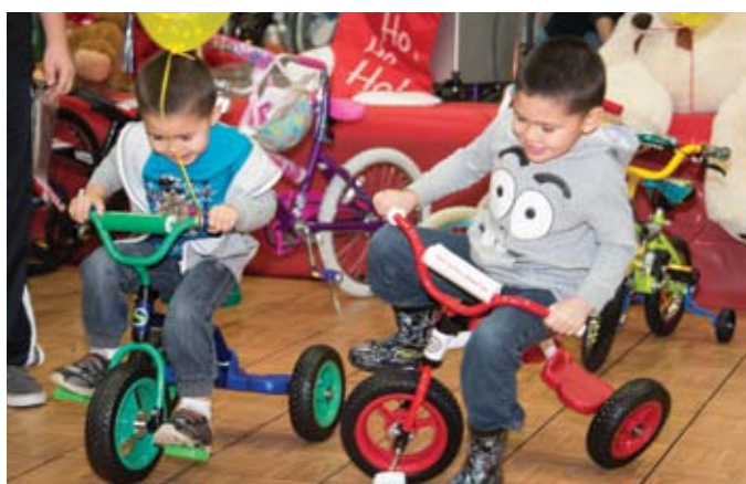
Annual bike race; and yes, all the kids keep the bikes!

The best part about an Extreme Christmas Dinner is that we all pitch in together to pull it off! You can complete the volunteer application by using this link www.extremeoutreach.com/christmas-volunteer-application , or visit our website and click the links to our "Christmas volunteer" application: www.extremeoutreach.com . ♥