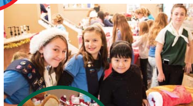
Girl Guide helpers.