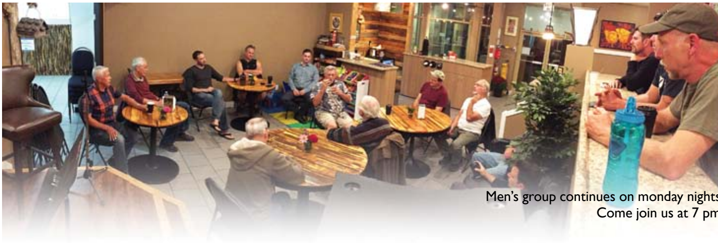
Men's group continues on monday nights. Come join us at 7 pm.