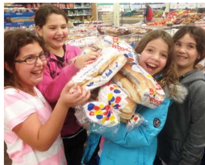
These girls put their money together and helped serve the community at the BBQ.

Will Your Company Be Next to Sponsor a BBQ?