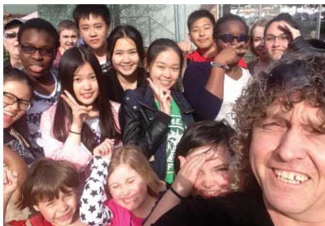
SMUS students take the lead.