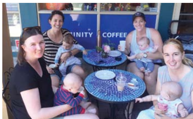
Moms with babies are regulars at the Coffee House and they say "...this is the best place to have a nice time together, and the sandwiches and coffee are great!"