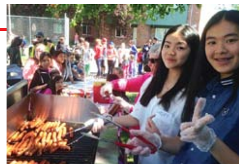
SMUS students in action.

W e have hosted many groups at our weekly BBQ and SMUS is always leading the way. We have trained over 200 students in the past five years and it's always fun to see the international students play with the kids. ♥