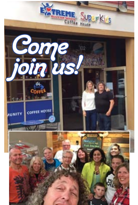
A big Thank You to our volunteers!