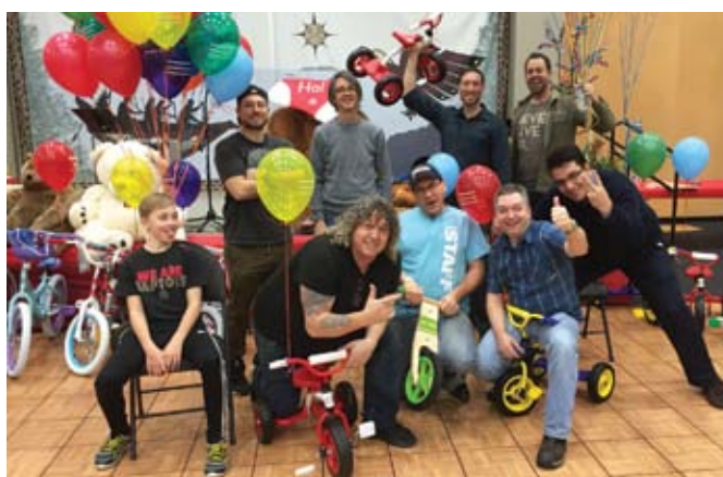
Our set-up crew.