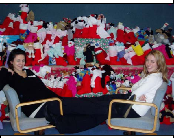
400 Kid's stockings needed! Stocking details at www.extremeoutreach.com