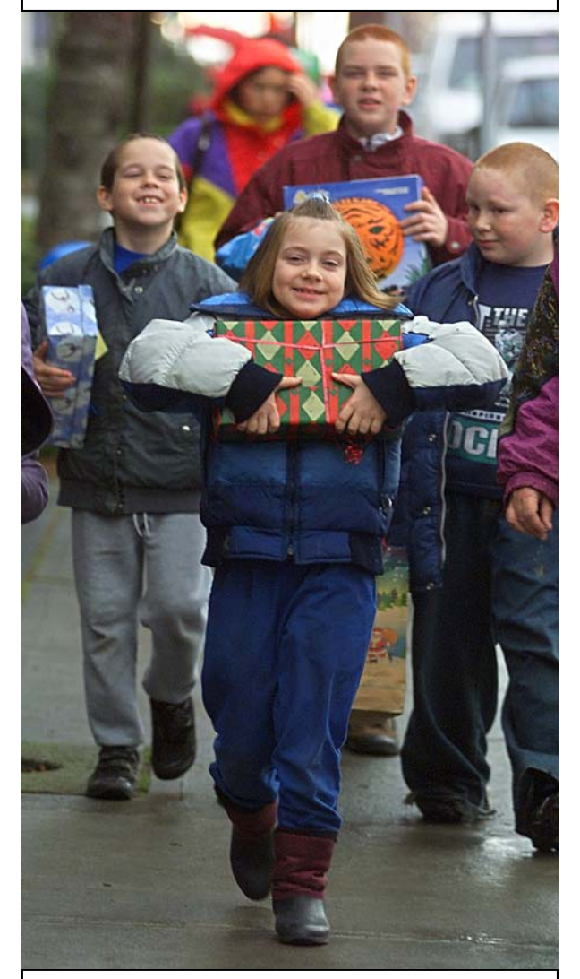
It's the perfect time to share a meal and a gift with the kids.