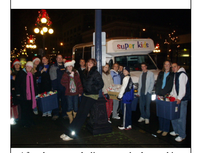
After the outreach dinner we do the stocking hand out. It's a great time as we drive to different locations and walk the streets to hand out all the stockings.