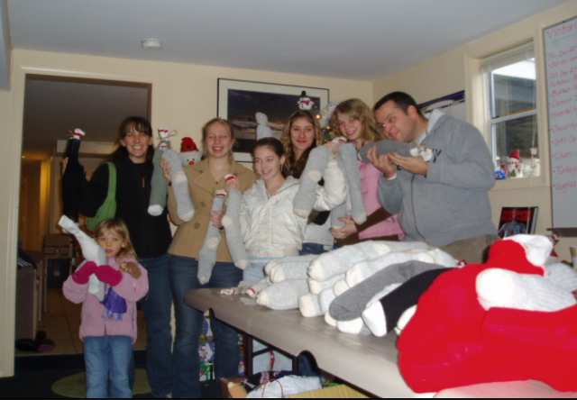
Different groups take up the challenge and show up with stockings of all sorts! 300 men's stockings needed!