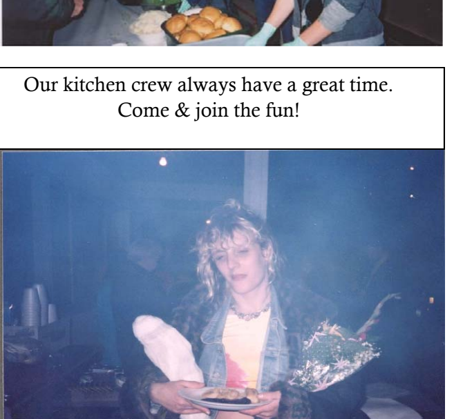
This is a picture from my very first Christmas dinner at the Holiday Court Motel in 1996. Steak and perogies cooked on a BBQ. It's always a great time to hand out gifts and stockings.