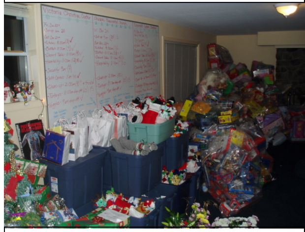
We need gifts of all kinds. At the dinner we hand out a gift to every child.