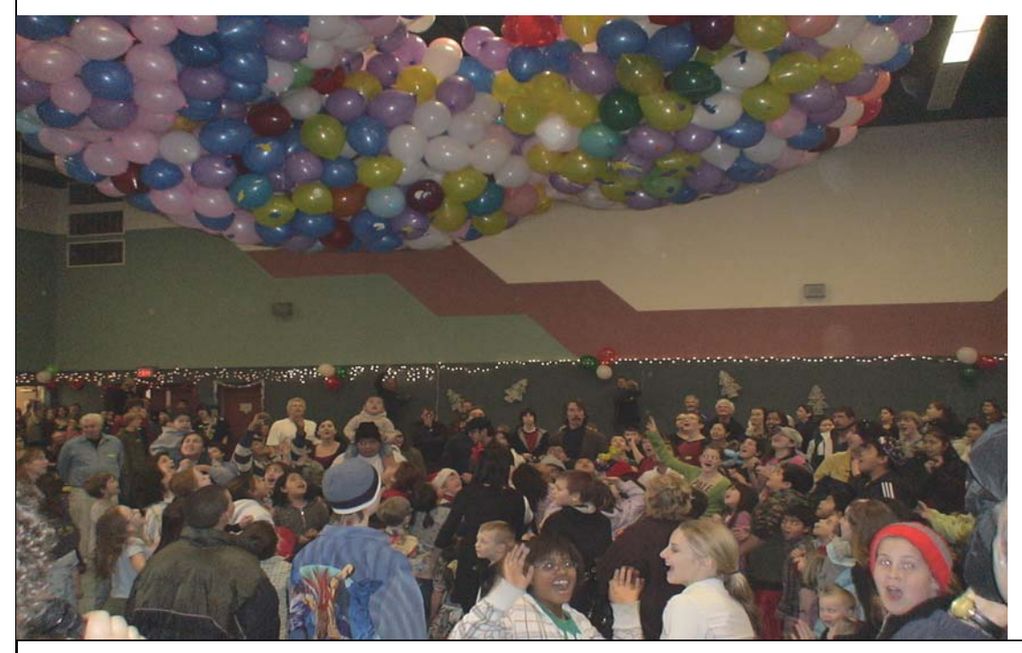
"I bring you good news of great joy that will be for all people." Luke 2:10