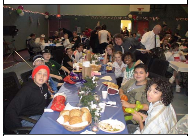
The big day! Approximately 500 people show up then the fun begins.