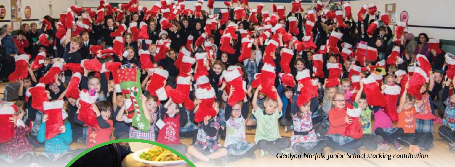
Glenlyon Norfolk Junior School stocking contribution.