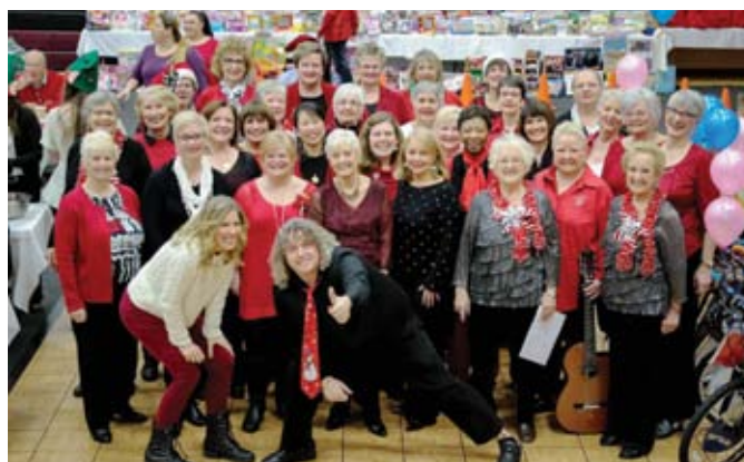
Special music by Pacific Edge Chorus at the 2016 dinner was a real treat.