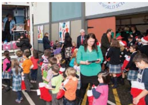
Glenlyon Norfolk Junior School students bring out the stockings.

Would your group, family or business like to create some Stockings?