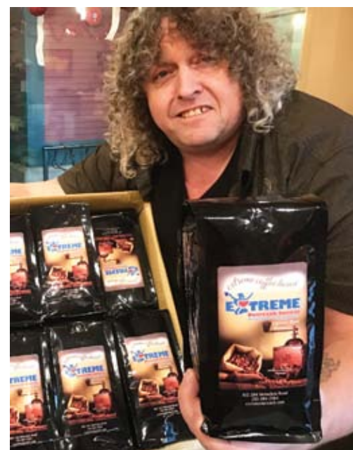
Cliff with our own coffee blend.

102 – 284 Helmcken Road Monday–Friday, 8:30 am–4 pm 250-384-2064