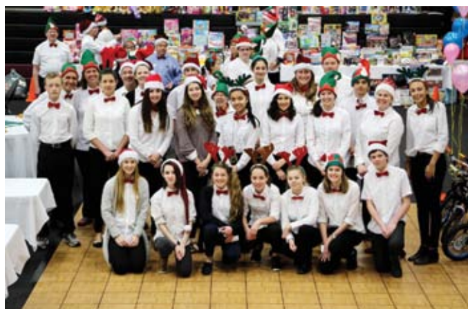
Thanks to our 2016 Glenlyon Norfolk School volunteers!

The best part about an Extreme Christmas Dinner is that we all pitch in together to pull it off! You can complete the volunteer application by using this link www.extremeoutreach.com/christmas-volunteer-application , or visit our website and click the links to our "Christmas volunteer" application: www.extremeoutreach.com . ♥