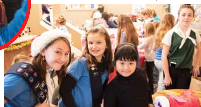
Girl Guide helpers.