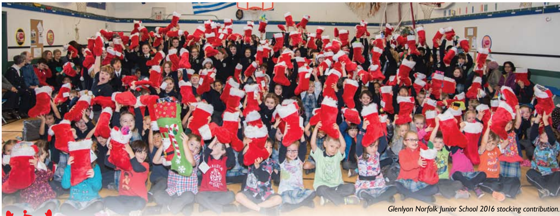
Glenlyon Norfolk Junior School 2016 stocking contribution.