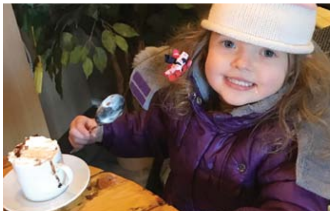
Enjoying Christmas hot chocolate!

Recently a local business purchased 300 bags of coffee for their company Christmas gifts. Thank you! Share the love of coffee and see what ripples you can make in our community. We'll be sure to keep you posted on all the things we are up to. Together we can make a difference! ❤️