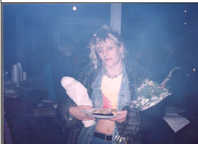
This is a picture from my very first Christmas dinner at the Holiday Court Motel in 1996. Steak and perogies cooked on a BBQ. It's always a great time to hand out gifts and stockings.

This is a great time to share your faith and give a helping hand!