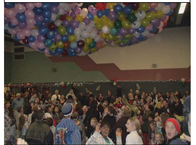
Our guests await the famous balloon drop loaded with gifts.