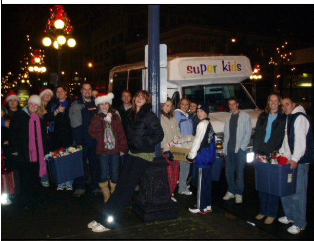
After the outreach dinner we do the stocking hand out. It's a great time as we drive to different locations and walk the streets to hand out all the stockings.