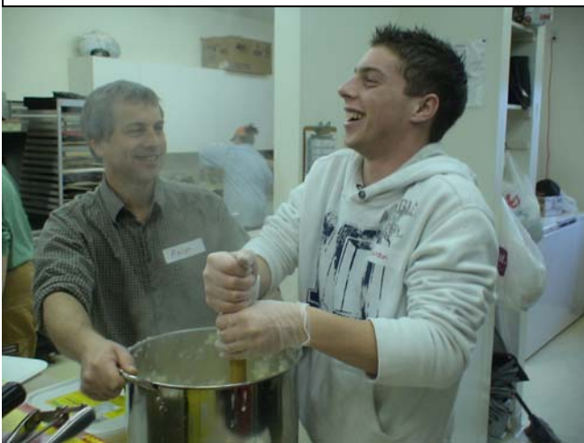
Our kitchen crew always have a great time. Come & join the fun!