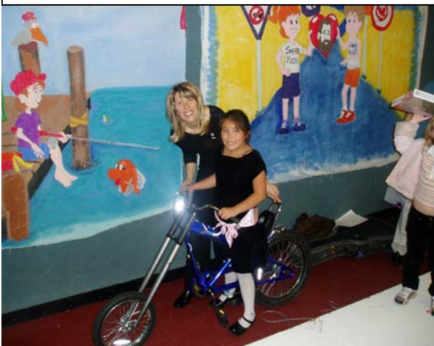
This is one of our many bike draw winners