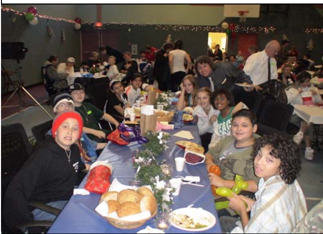
The big day! Approximately 450 people show up and the fun begins.