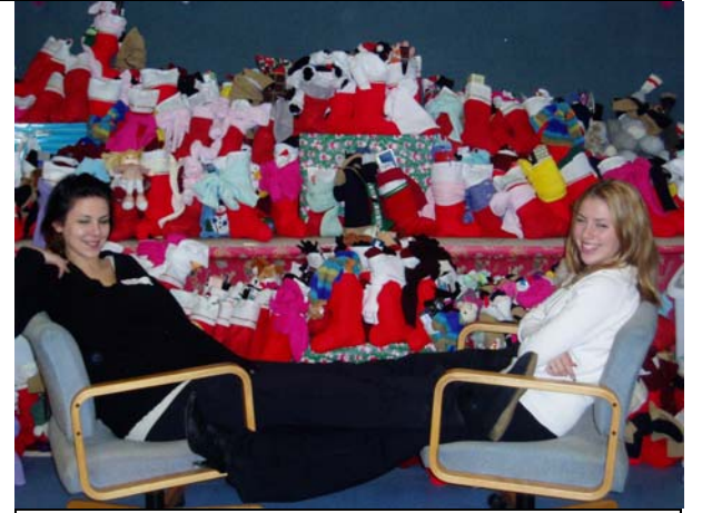
The goal is approximately 1000 stockings!