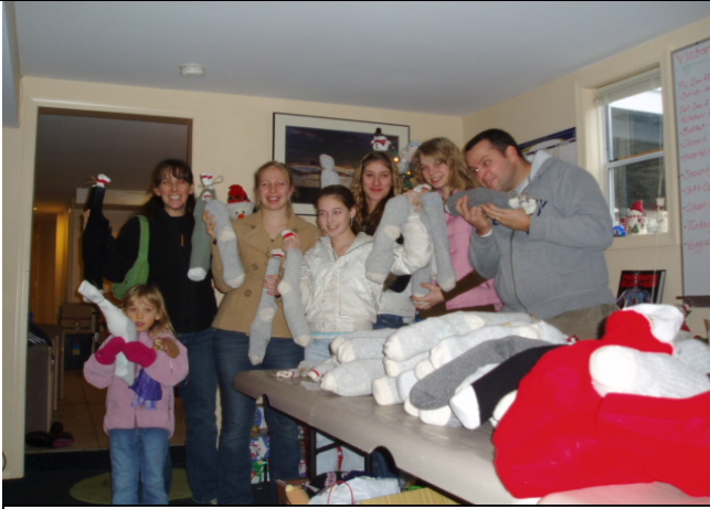
Different youth groups show up with stockings of all sorts! Thanks guys!