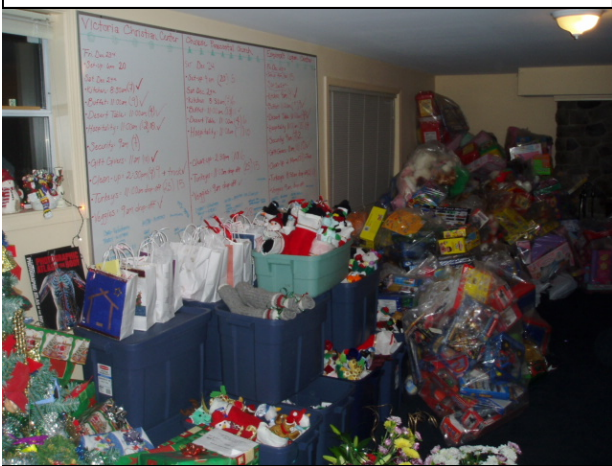
Then the gifts begin to pile in as we get closer to the dinner.