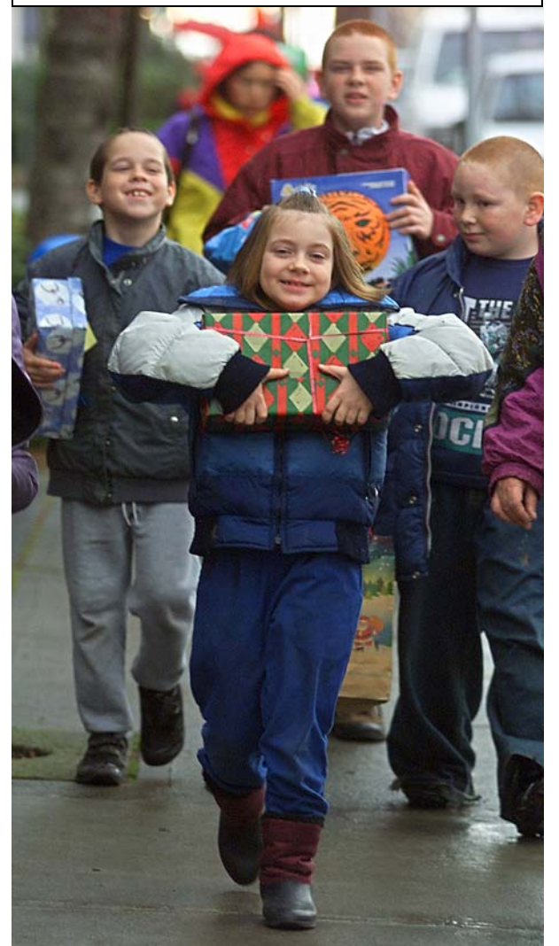
It's the perfect time to share a meal and a gift with the kids.