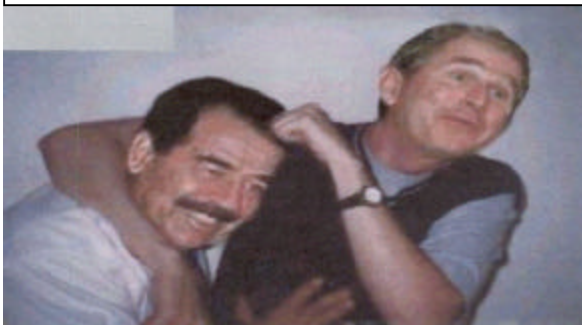
Sadam and George Bush make up

Reminder we at Extreme Outreach are planning a city wide outreach called The Father Loves Victoria . This will take place Christmas Eve. Were expecting a big turn out. We'll keep you posted. This event will take about 100 volunteers so if you can mark your calendar now. Lets take our city for God!