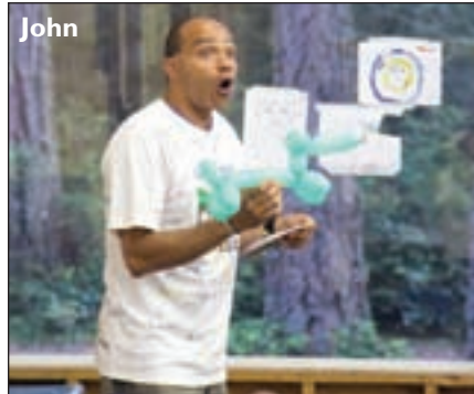
John Word to Life ministries in action.

Thank you SO much to everyone who sponsored a kid to go to camp this year, to all of our amazing and tireless volunteers, and everyone who supported us. A big thank you to Scotiabank in Sidney, who helped us raise $11,000 by hosting a BBQ and matching all donations! ❤️