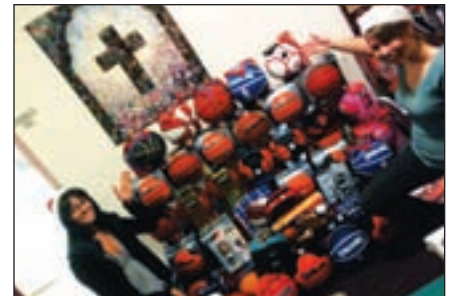
Sports balls donated by Glad Tidings Adore Church