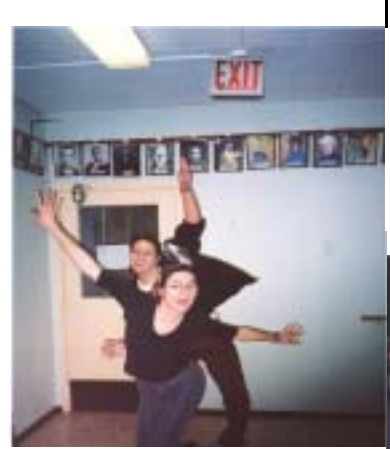
EXTREME OUTREACH Photo of the month ( Dance before the Dinner)